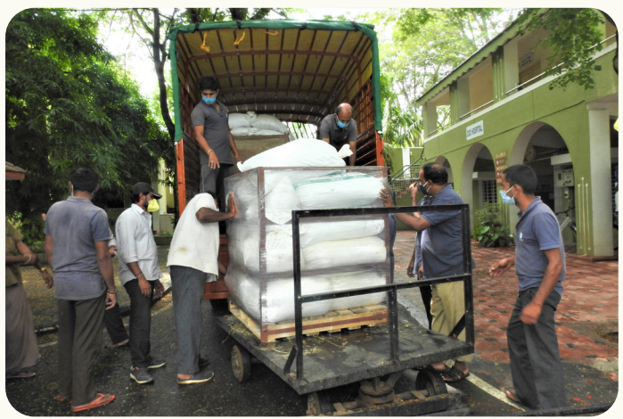
Preparation of Feed for animals during Traveling